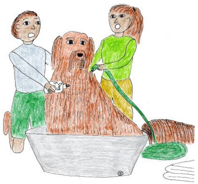
I said, "Keep soap from his eyes and nose."