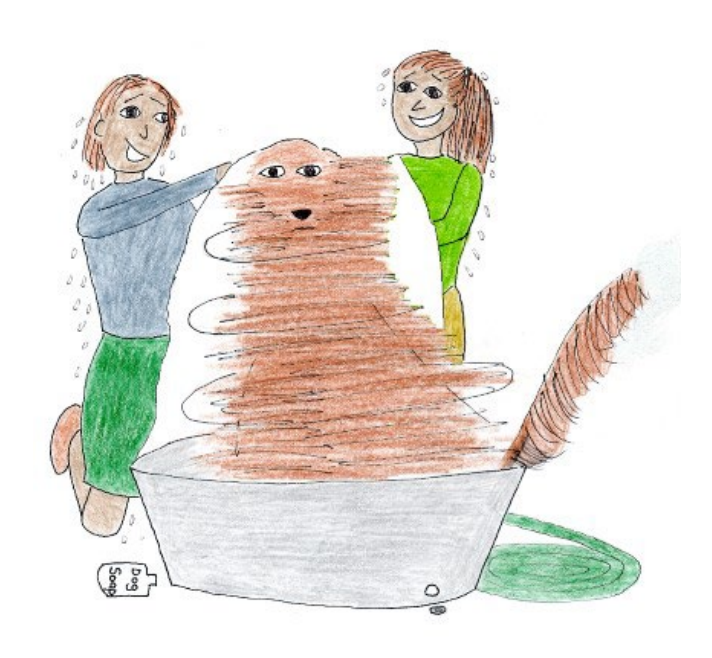
we were both wet too!