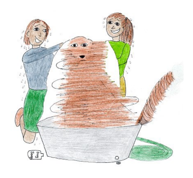
...Comet gave a shake and like we said at the beginning...