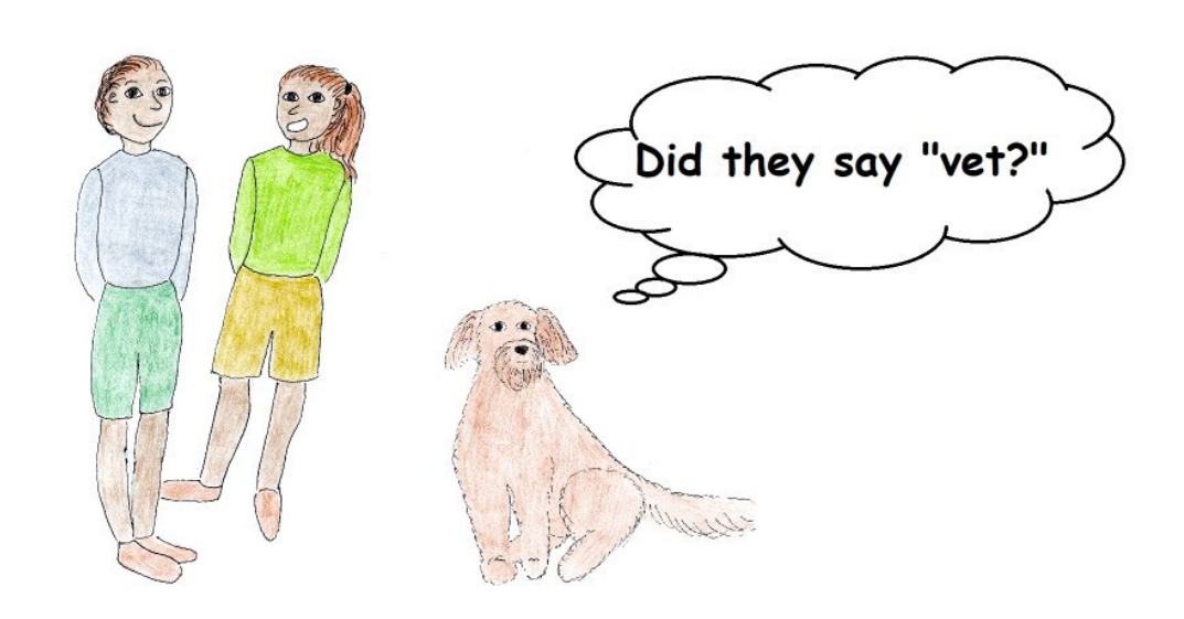
We had to wash our pet, Comet, before going to the vet.