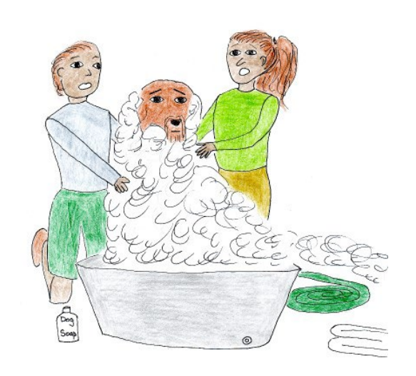
Chet said to Comet, "Be still, we're not through yet!"