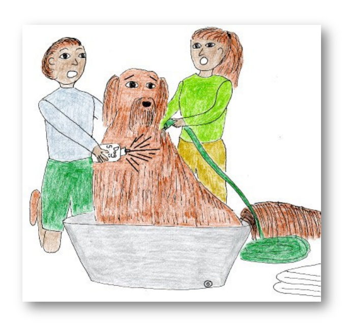
The soap shot out like a jet and Comet got quite upset.