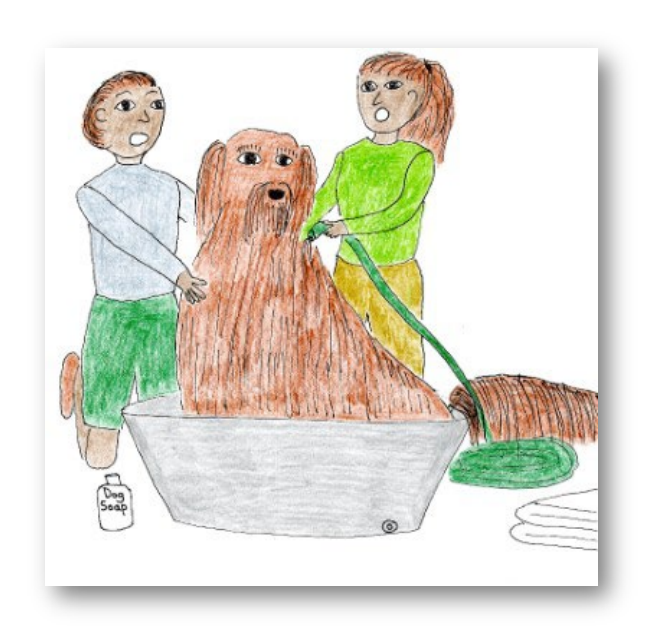
Comet let me wet him down.