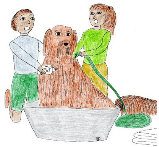
I said, "Keep soap from his eyes and nose."