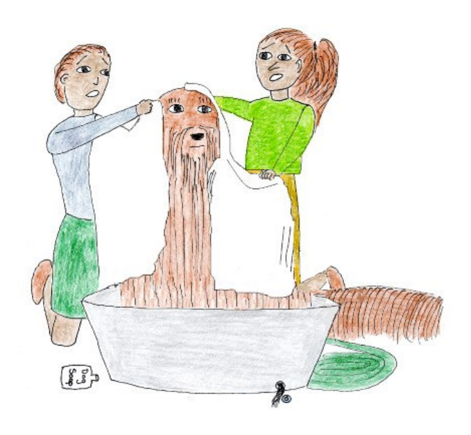
We both tried to dry him, but...