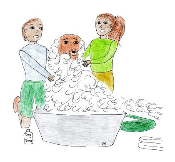
Chet said to Comet, "Be still, we're not through yet!"