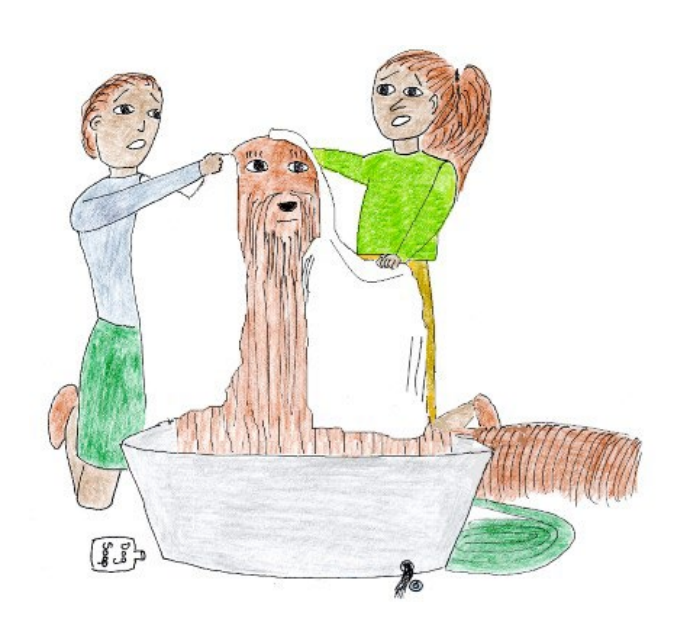
We both tried to dry him, but...