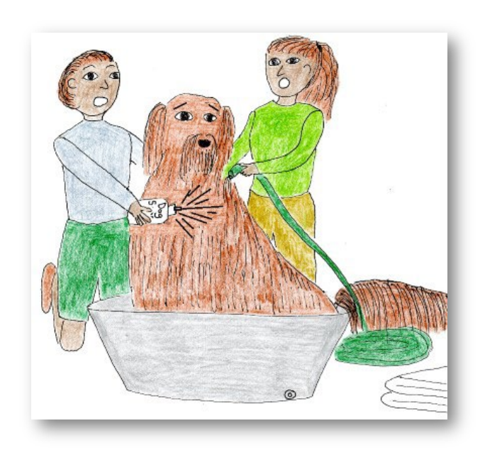
The soap shot out like a jet and Comet got quite upset.