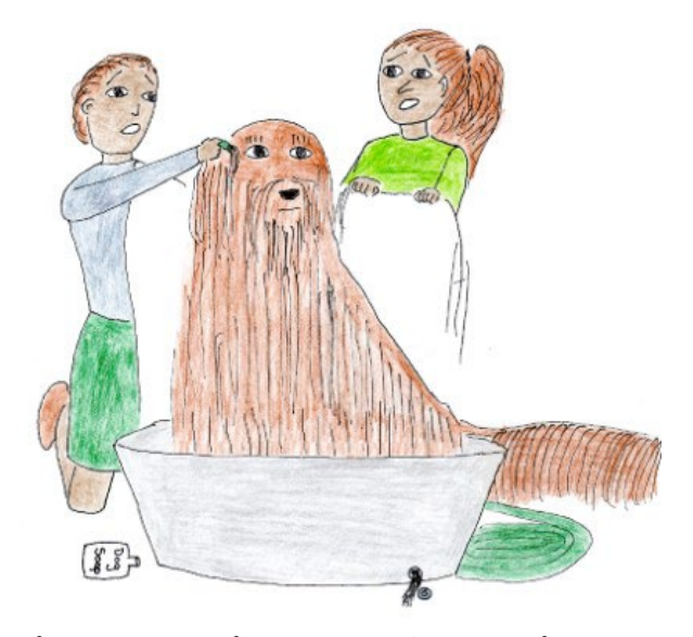
I threw Chet a beach towel too. We were completely set.