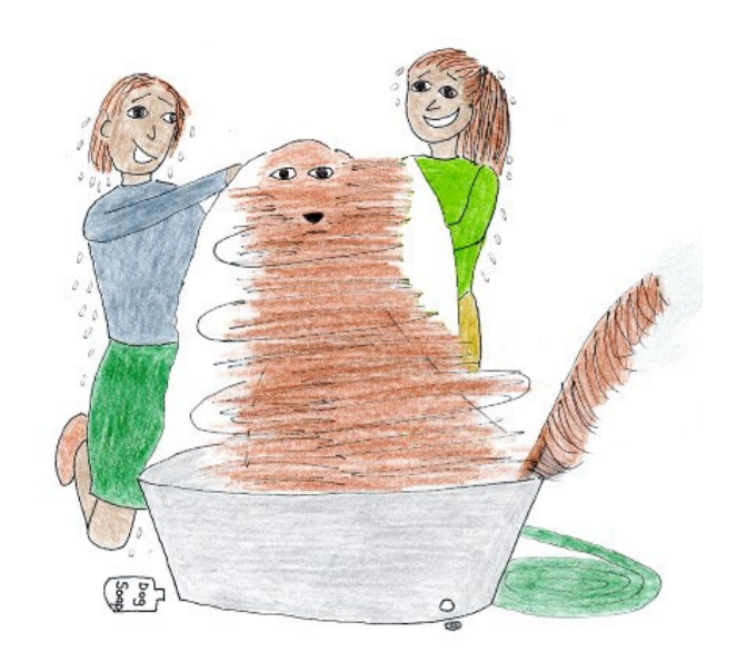
...Comet gave a shake and like we said at the beginning...