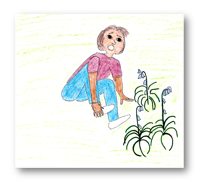
Nell called out as her ankle began to swell.