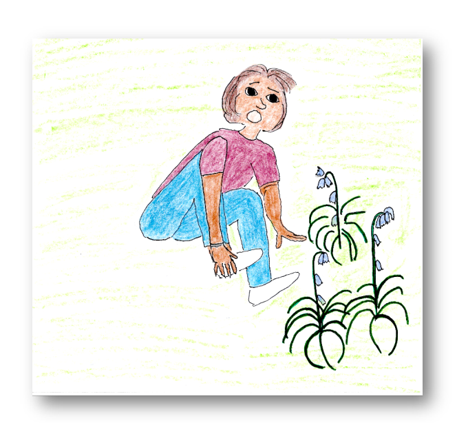
"Make my bones and ankle jell." "Reduce the swelling and make me well."