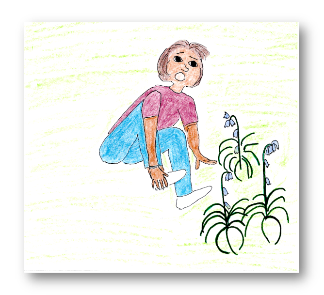
She gave a cry and yell, "Lord Jesus, no one will find me for hours!"