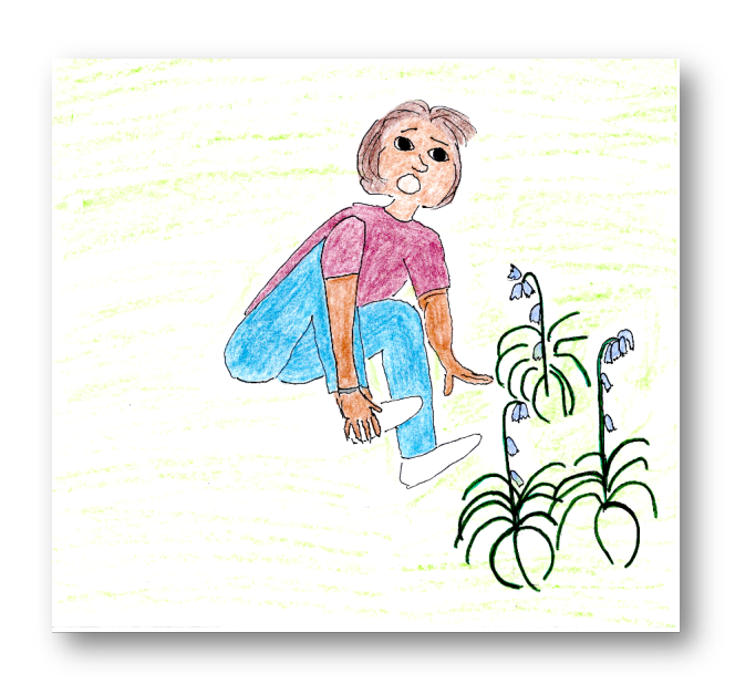
She gave a cry and yell, "Lord Jesus, no one will find me for hours!"