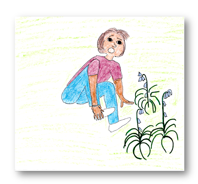
Nell fell pell-mell while smelling bluebell flowers.